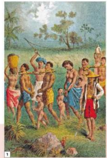
1 A group of captured Africans being taken to become slaves. Print, ca 1860.

Lincoln's victory changed the relationship between the American government and the institution of slavery. It led to South Carolina's withdrawal from the Union. Within two months, six other states joined South Carolina in forming an independent 'Confederacy'. War followed because Lincoln, supported by a majority of northerners, refused to concede that any American had the constitutional right to withdraw from the Union, and not certainly in response to a legitimately-won democratic election.