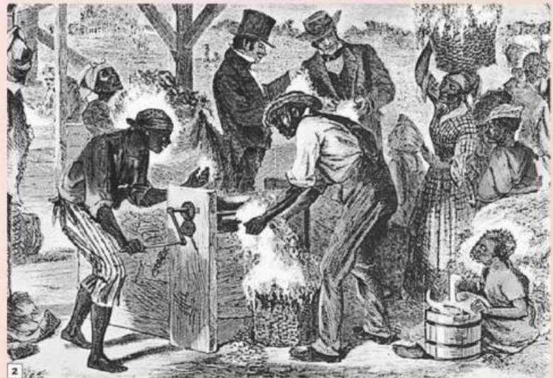
2 Slaves on an American cotton plantation, using a cotton gin.